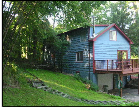
Single Family Detached Book Format

SF/ LN: 98246178 ER SOLD Market Time: 47 - Days List: $339,000 Off Market: 09/07/05 Closed: 10/14/05 SO: K07701 SA: 7692 Sale: $321,500